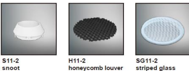
S11-2 snoot H11-2 honeycomb louver SG11-2 striped glass